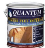
TIMBRE PLUS INTERIOR

A low VOC, non-toxic, low allergenic, oil based finish. Tintable to transparent or opaque colours. Available in a low sheen finish.