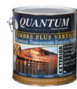
TIMBRE PLUS VERTICALS

Exterior doors & windows, weatherboards, handrails & garage doors.